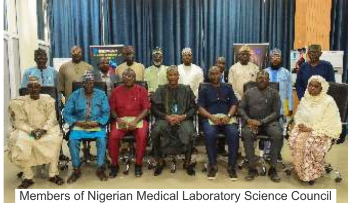
N 7 8 - 18 C